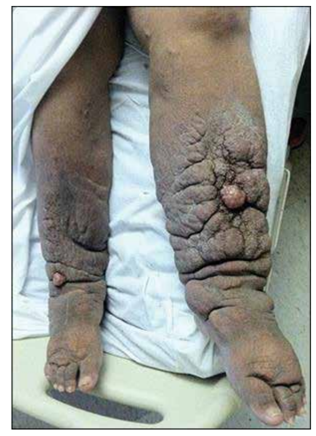
Fig. 5: Bilateral chronic lymphedema (elephantiasis)

(Figure 5). Kaposi-stemmer sign<sup>5</sup> - It is the inability to pinch the skin on the dorsum of the foot near the second toe.