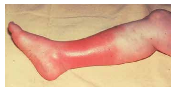
Fig. 1: Right leg Cellulitis with edema

Local Causes – compartment syndrome, chronic venous insufficiency