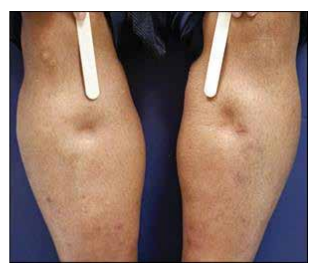
Fig. 4: Bilateral pitting pedal edema

the illness indicates an acute cause like Cellulitis, DVT, Compartment syndrome etc.. which usually occurs in 72 hours. 9,10