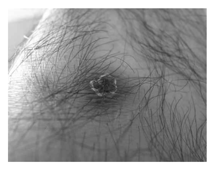
Figure 2 : Showing eschar